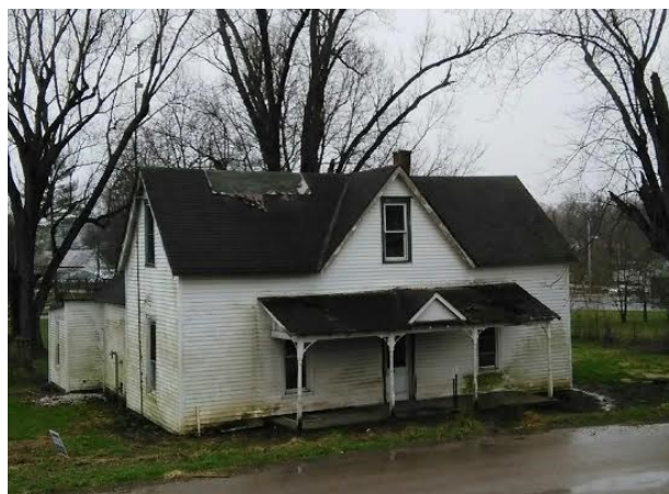
The former boarding house can be found on Spencer Pike road.